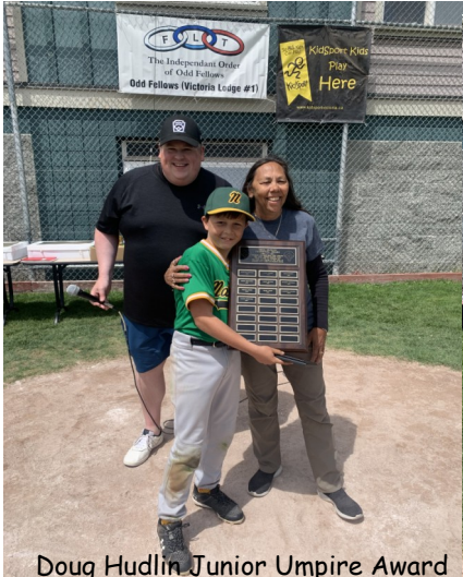
Doug Hudlin Junior Umpire Award