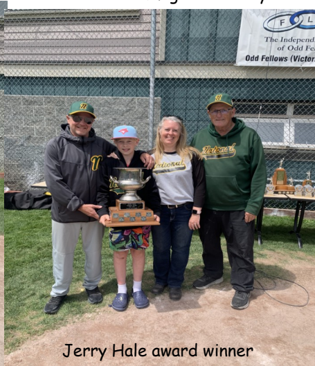
Jerry Hale award winner