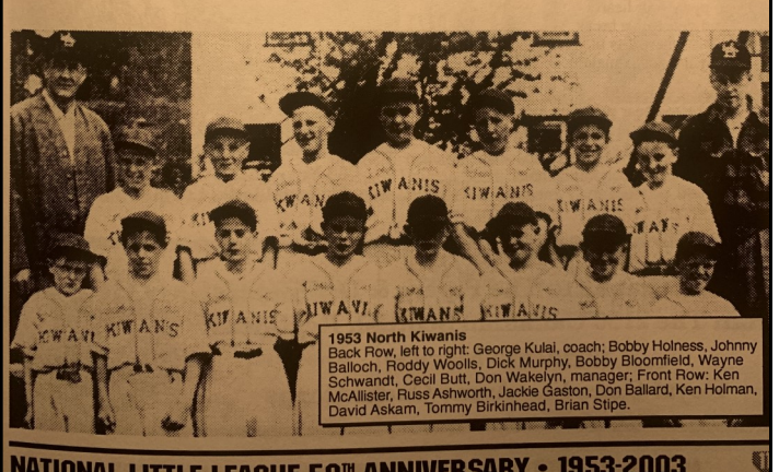
1953 North Kiwanis