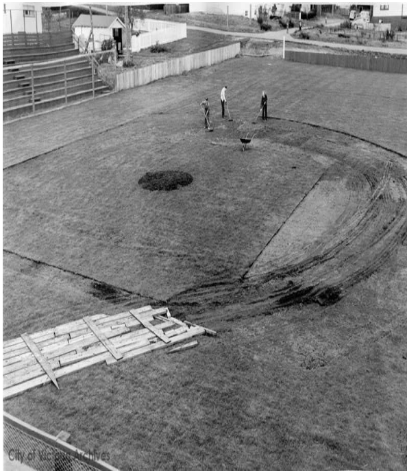
Construction of Jaycee National Little League in 1953

Just as proud, happy and nervous as the kids were, so were the members of the Junior Chamber of Commerce who have done a terrific job and rendered the city a great service in bringing Little League baseball to Victoria.